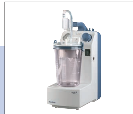
National Wound Care Closed Suction Wound Drainage System Code name: Wound Sucker™

When you choose National Wound Care, you get superior products and much more. You get the peace of mind that comes with knowing you have a partner in delivering the finest care. We invite you to review our complete line of wound care products and programs.